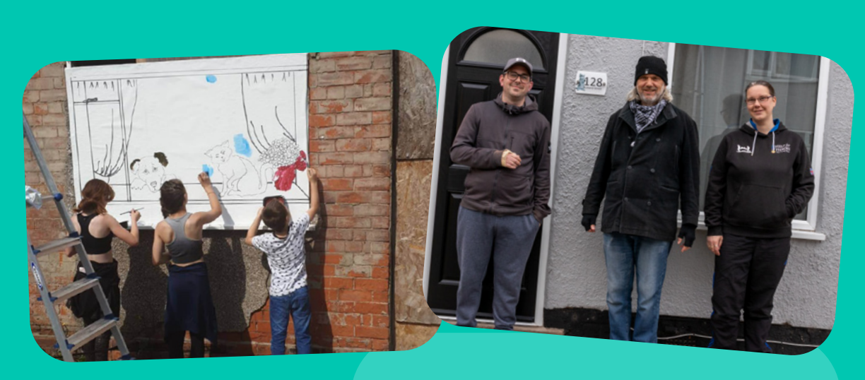
East Marsh Community

The share offer exceeded their target of £250,000. They raised over £0.5million from 162 investors while running a parallel local membership offer for residents in East Marsh to ensure broad community accountability.