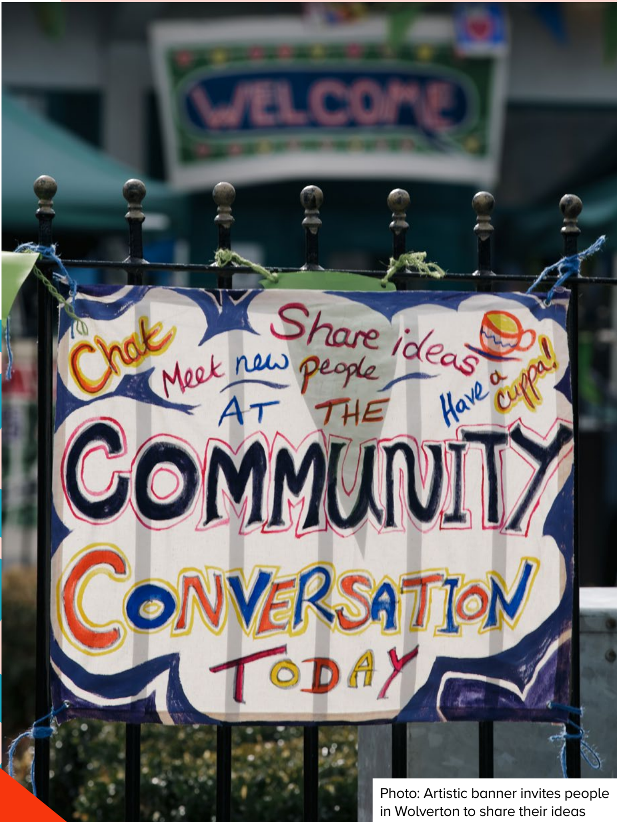
Photo: Artistic banner invites people in Wolverton to share their ideas