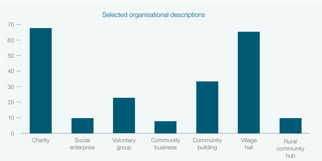
Table 2: Organisational type

Community business was the least chosen description at 9% (N. 7). However, once the term community business was explained using Power to Change’s four qualifying tests, the number of respondents subsequently describing themselves as community business rose to 64% (N. 54).